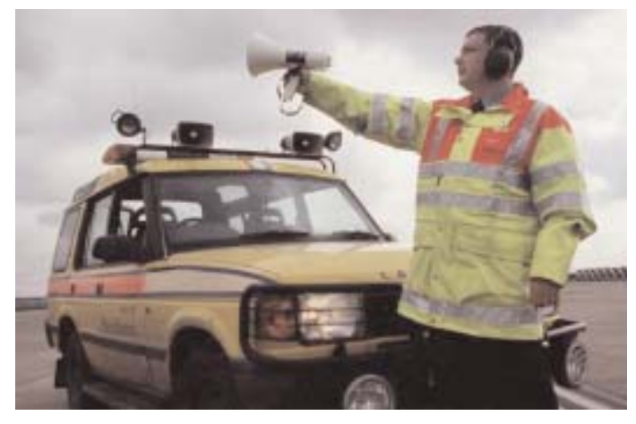
A mobile patrol equipped with scaring devices such as pyrotechnics and distress calls is the most efficient way to detect and disperse birds

pyrotechnic and other devices with an element of lethal control is important because it helps to ensure that birds/wildlife do not habituate to the control programme and permits the selective removal of any birds/wildlife that fail to respond to the dispersal techniques deployed.