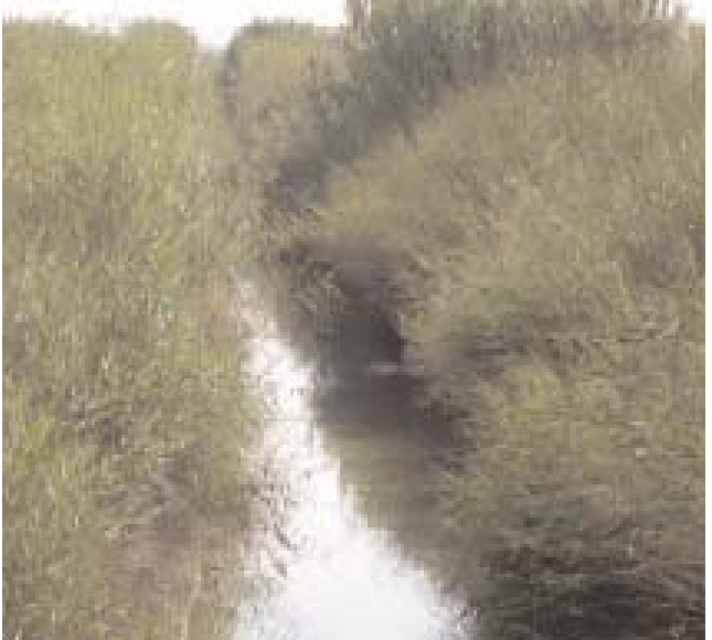
Overgrown ditches like this provide good shelter and nesting cover for hazardous birds

The reasons why birds frequent an airfield are not always obvious. They may be attracted to food such as invertebrates, small mammals, seeds or plants in the grassland; water from ponds, ditches, or puddles on the tarmac, nesting sites in trees, bushes or buildings, or simply the security offered by large open spaces where they can easily see approaching predators. In some cases it may be obvious what